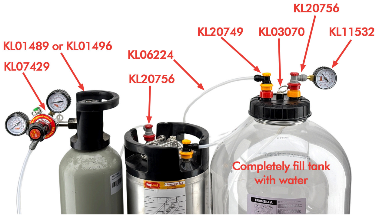
Hydro Test - Cornelius Keg Setup